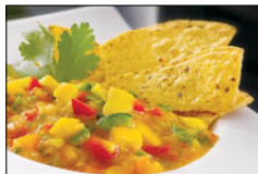
Perfectly chop ingredients