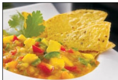
Perfectly chop ingredients